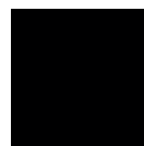
Black nano- laminate